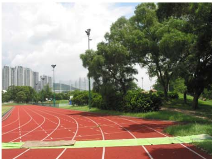
5. Athletics Track