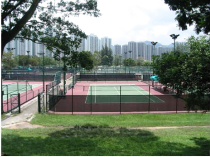
1. Tennis Courts