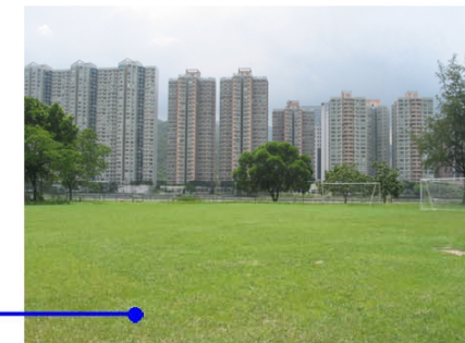
9. Site of proposed Stable Precinct