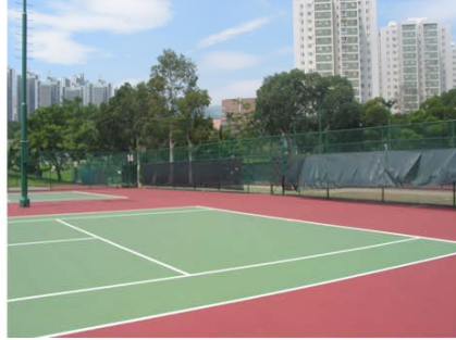
2. Tennis Courts