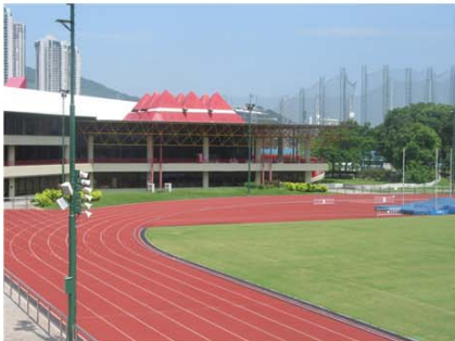
3. Sports Pitch and Athletics Track