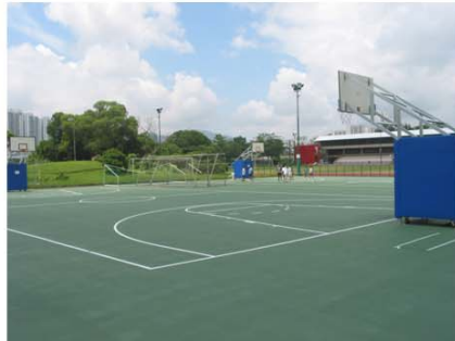
6. Basket Ball Court