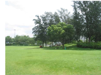
7. Site of proposed Stable Precinct