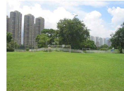
8. Site of proposed Logistics Compound